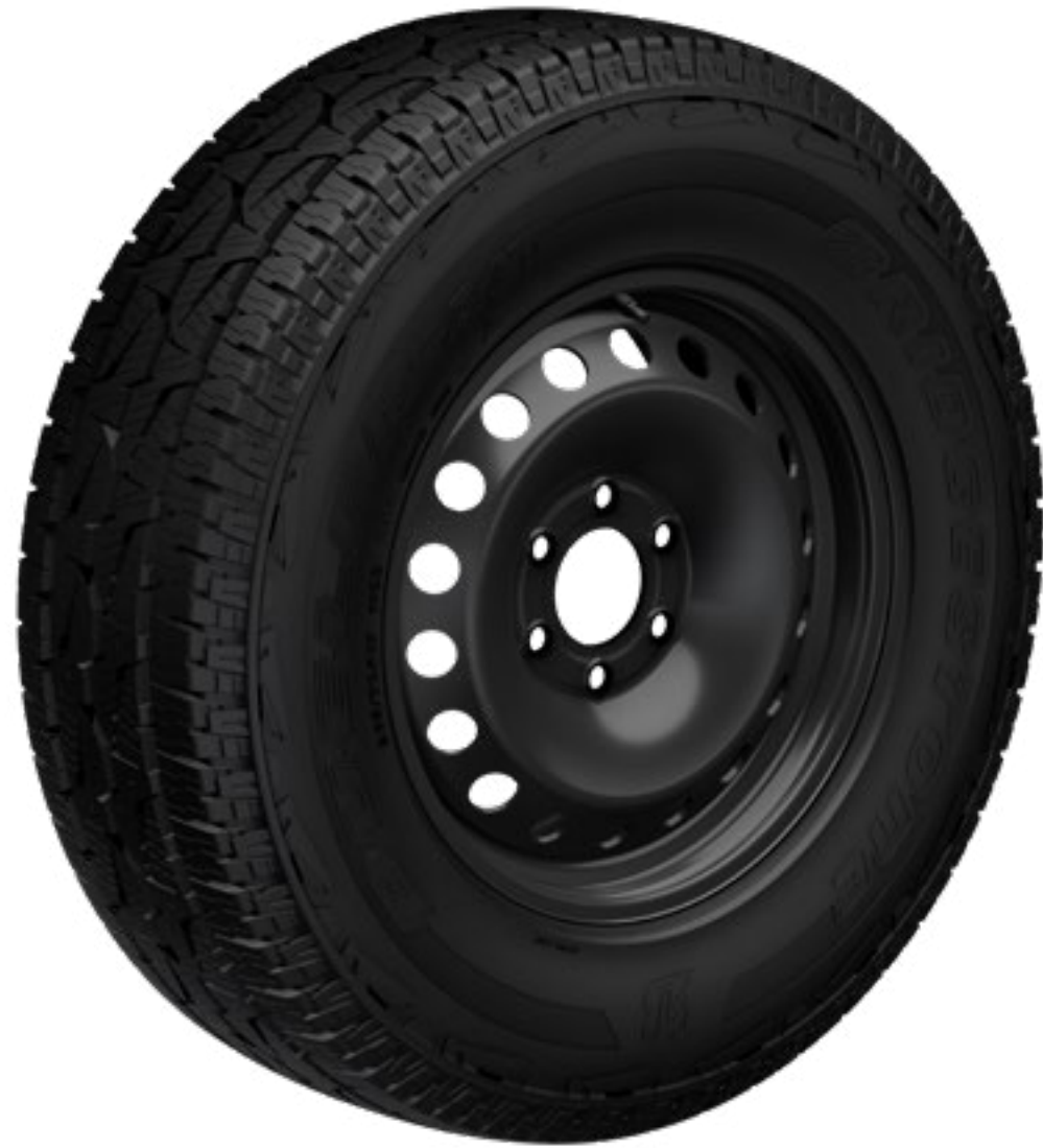
BRIDGESTONE ALL-TERRAIN TYRE