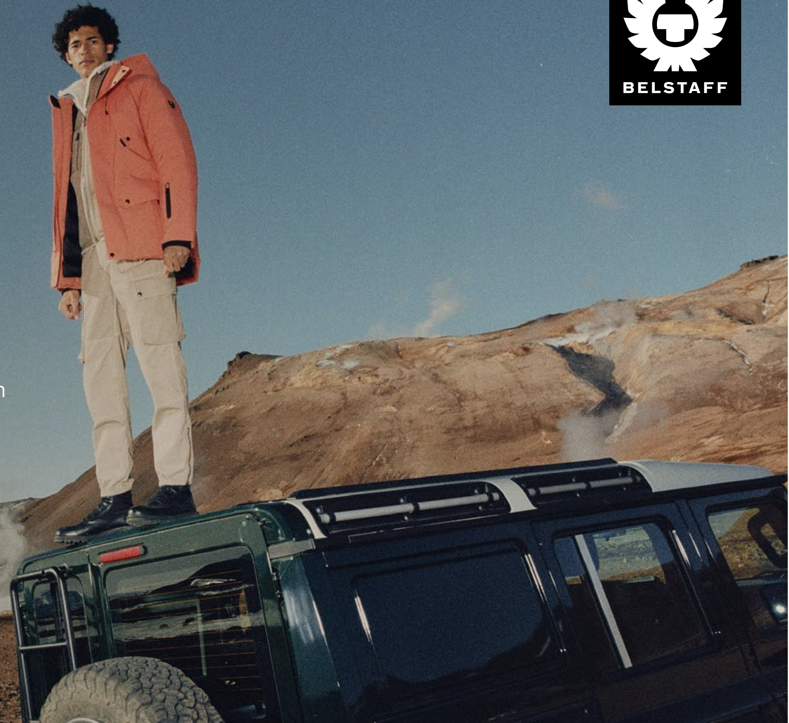
The Grenadier, photographed on location with Belstaff in Reykjahlíð, Iceland.

Together, we share an appreciation of the journey there - wherever there might be.